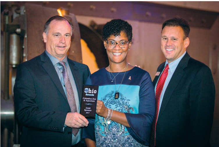
Supplier Diversity: Columbus Zoo & Aquarium