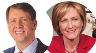
RICH CORDRAY & BETTY SUTTON for Governor & Lt. Governor

Democrats have a Blueprint for Ohio that ensures: