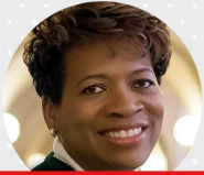
MELODY J. STEWART for Justice of the Supreme Court