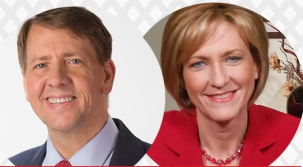
RICH CORDRAY & BETTY SUTTON for Governor & Lt. Governor

Democrats have a Blueprint for Ohio that ensures: