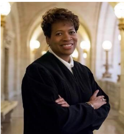
Judge Melody J. Stewart

Ohioans deserve a justice system that they can trust and be confident will treat everyone equally under the law, which is a primary motivating force behind the Democratic Party candidacy of Judge Melody J. Stewart.