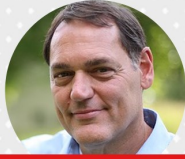
ZACK SPACE for Auditor of State