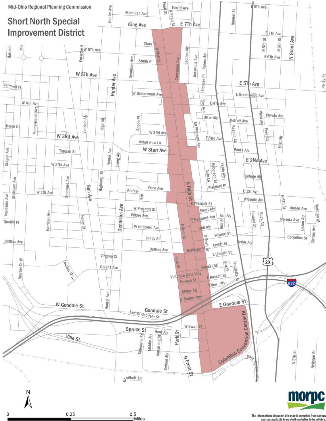
Figure 2: Short North Special Improvement District