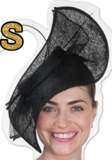
Designer Women's Hats