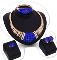
Beautiful Jewelry & Accessories