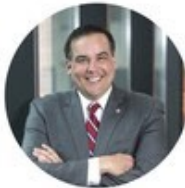
ANDREW J. GINTHER Mayor City of Columbus