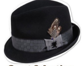
Great Selection Men's Hats