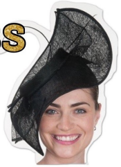
Designer Women's Hats