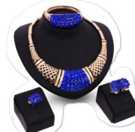
Beautiful Jewelry & Accessories