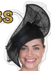
Designer Women's Hats