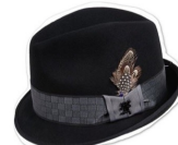
Great Selection Men's Hats