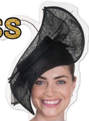
Designer Women's Hats