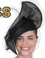
Designer Women's Hats

6758 E. Main Street, Reynoldsburg, Ohio 43068