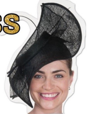
Designer Women's Hats