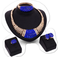
Beautiful Jewelry & Accessories