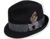
Great Selection Men's Hats