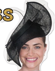
Designer Women's Hats