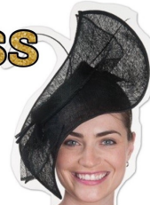
Designer Women's Hats