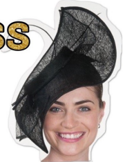
Designer Women's Hats