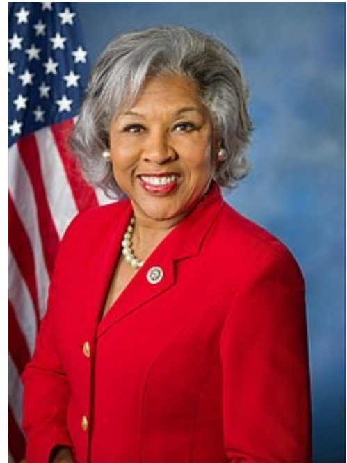
Congresswoman Joyce Beatty

During my time in Congress, I have had the