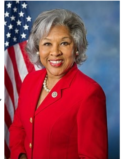
Congresswoman Joyce Beatty

Today, August 13, 2020, is Black Women's Equal Pay Day, which marks the number of days a Black woman must work into the year to earn what her white male counterpart earned in the previous year. As a strong advocate and supporter for racial and gender pay equity, U.S. Congresswoman Joyce Beatty (OH-03) issued the following statement: